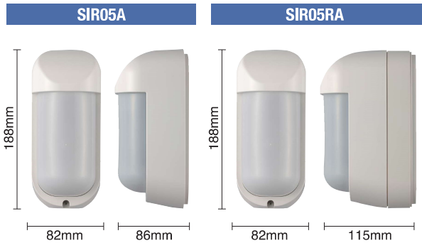
SIR05A/SIR05RA Dimensions (Unit : mm)

WIRED MODEL SIR05A WIRELESS MODEL SIR05RA